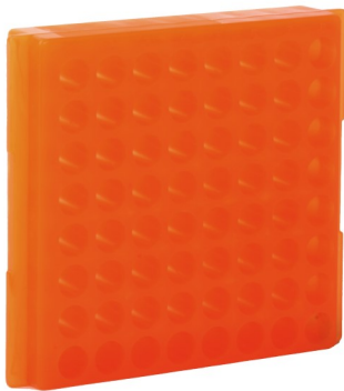
64 Well Micro Tube Rack, Orange. Cat# 0084

Alpha-numeric markings, “A” thru “H” vertically, 1 thru 8 horizontally.